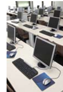
Classroom instruction at our Michigan factory is used for intensive training of operators, technicians, management and distributors.